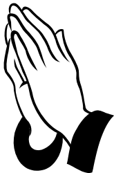
In Our Prayers